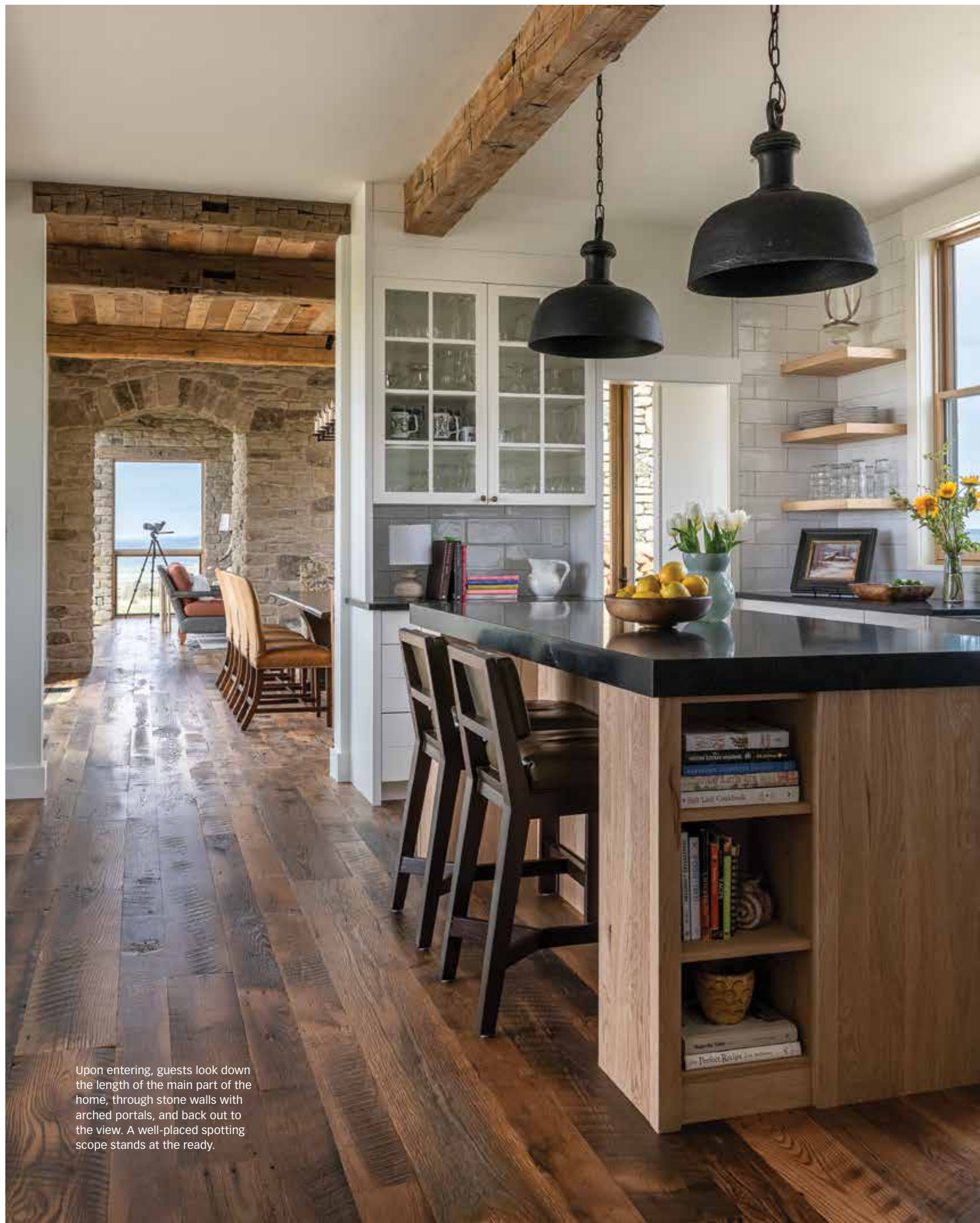
Upon entering, guests look down the length of the main part of the home, through stone walls with arched portals, and back out to the view. A well-placed spotting scope stands at the ready.