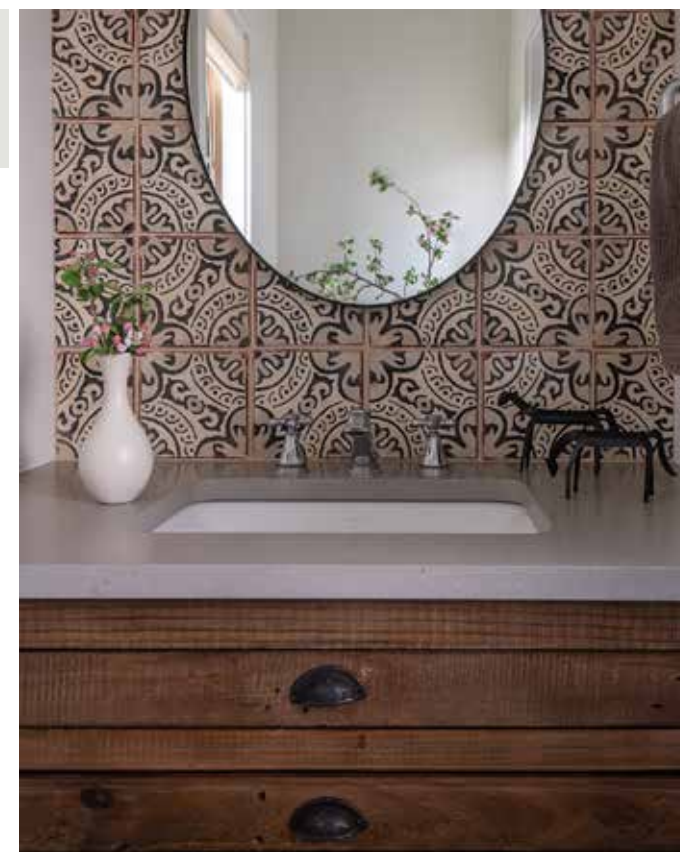
In the powder room, Tabarka tile from Onyx Studio in Bozeman offers color and movement.