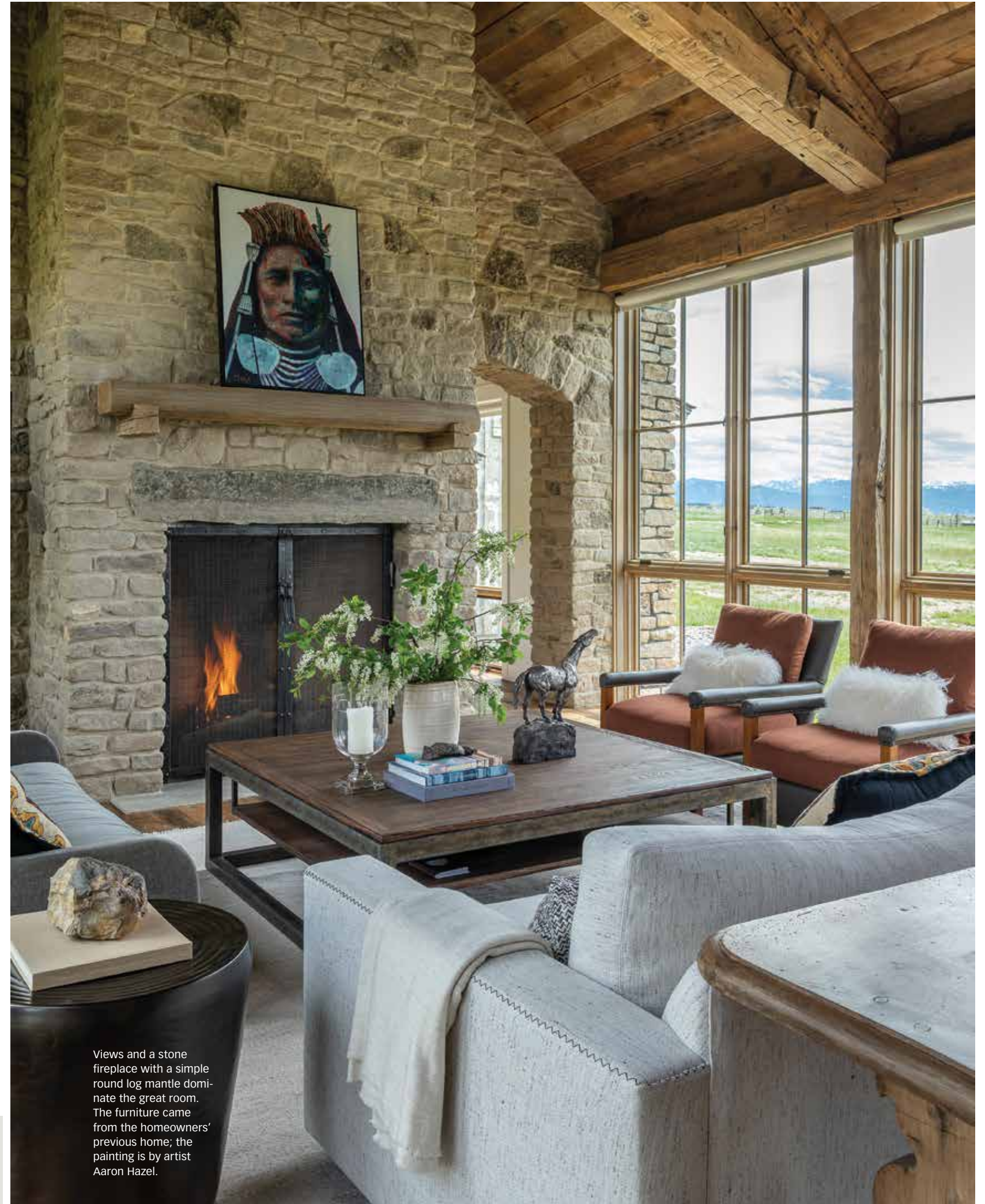
Views and a stone fireplace with a simple round log mantle dominate the great room. The furniture came from the homeowners' previous home; the painting is by artist Aaron Hazel.