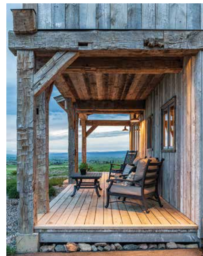
A simple porch defined by rough hand-hewn reclaimed beams extends the feeling of timelessness. "What's cool about the property," says architect Travis Growney of JLF, "is that there's not one specific view, but views on all sides and different types of views. That was something we paid attention to and tried to take advantage of so that every space in the house has its own unique feel."

ceiling without any apparent structure creates a beautiful light and airy detail. The lighting, which is often overlooked, is spectacular."