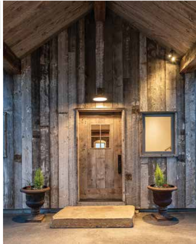
FROM TOP: One of the more unusual design decisions was to not include a formal entry. Instead, guests enter the home from the covered area that connects the house to the garage. This creates an informal feel that honors the rural nature of the area and the way the homeowners wanted to experience the house. • The primary bedroom, accessed through a connecting element, has total privacy and character thanks to the reclaimed, restacked log cabin sourced from Montana Reclaimed Lumber that defines the space. "We love the log feel, but didn't want a complete log house," explains the homeowner. "It's a fun feature and it's so cozy in there." The painting is by Rory Jackson; the bedding is from Pom Pom at Home.

The structure is approached from the east and, although the parcel is relatively flat, the house takes advantage of a contour within the landscape to hide it from view. It is designed in multiple volumes and only one section boasts an upper level. The garage — which is attached to the main structure by a porte-cochère roof — and public areas of the house are arranged linearly. On the far end, the great room volume bridges a natural swale. This adds interest and dynamism while managing the impact and lightening the look of the house. A connecting section with a built-in desk for the wife's office leads to a stacked-log cabin element housing the primary bedroom suite. This wing is offset at an angle from the main structure to accentuate the feeling of privacy and better capture the views. The reclaimed cabin, with its spa-like bathroom and private porch, creates a destination experience embellished with a distinctive hand-hewn character, making for a snug retreat