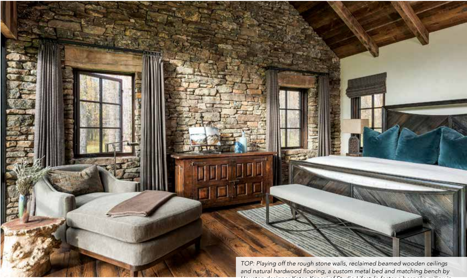
TOP: Playing off the rough stone walls, reclaimed beamed wooden ceilings and natural hardwood flooring, a custom metal bed and matching bench by Houston designer Ketan Kapasi of Studio Lifestyle foster a bespoke milieu in the elegant master bedroom. BOTTOM: A place for relaxation and respite, the sumptuous soaker tub enjoys stunning views of the lush, verdant landscape...>>